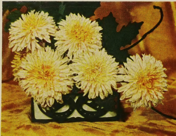
MURIEL RICE. $1.00 each; 3 for $2.50